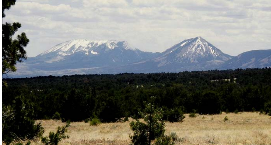
Your View of the Snow Capped Peaks of the Sangre De Cristo Mountains

Where Else in Colorado Can you Find 800 Acres of Solitude and Seclusion for $1,000 per acre !