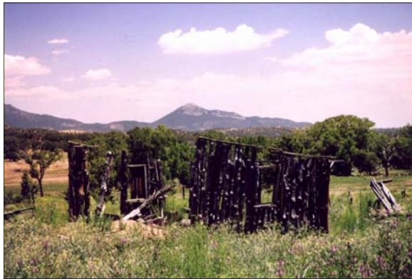
South View of the Spanish Peaks a.k.a. The Stairway to Heaven